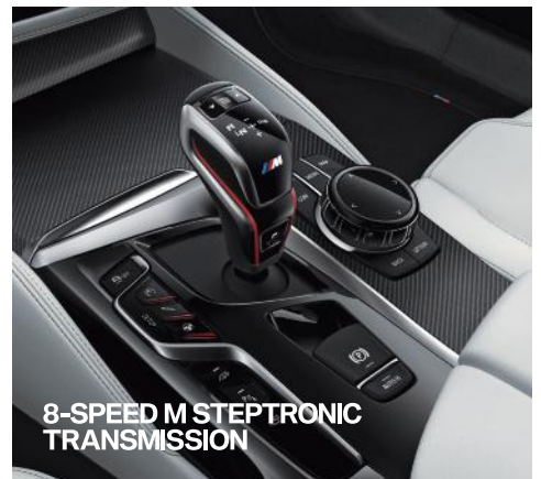
8-SPEED M STEPTRONIC TRANSMISSION