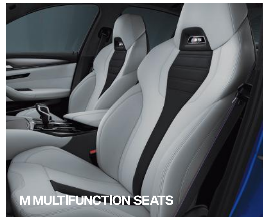
M MULTIFUNCTION SEATS