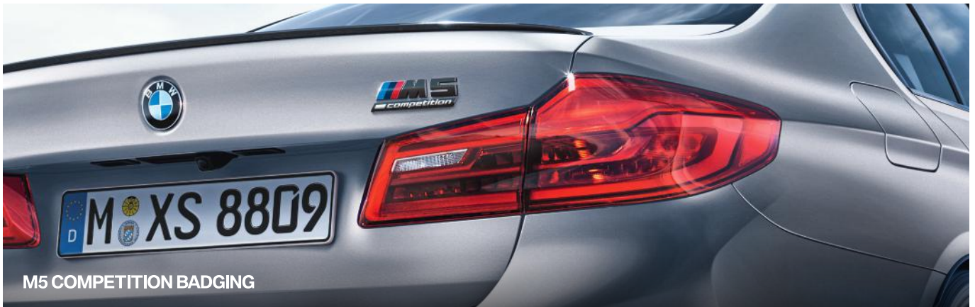
M5 COMPETITION BADGING