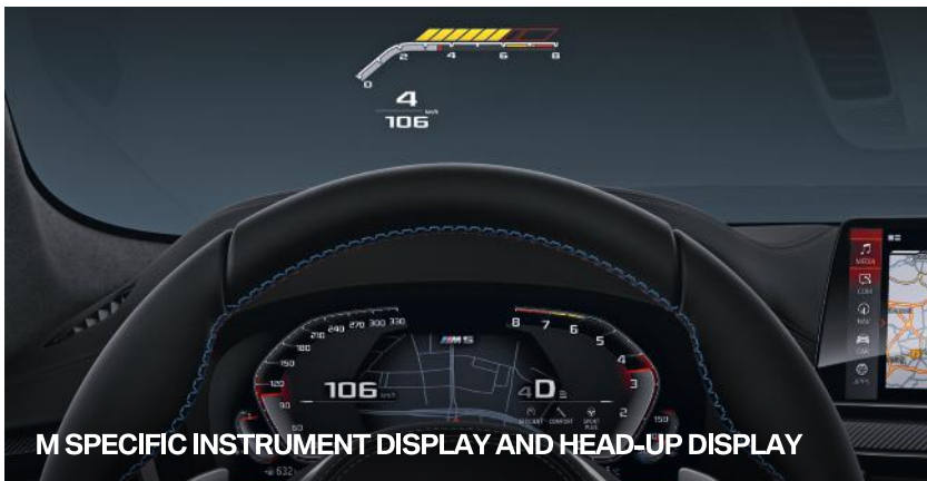
M SPECIFIC INSTRUMENT DISPLAY AND HEAD-UP DISPLAY