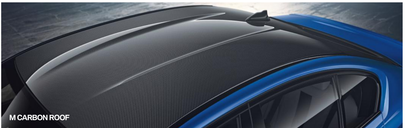
M CARBON ROOF